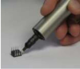
Figure 3. The probe contains the front end buffer amplifier

As the probe approaches the object to be measured, that object induces its voltage on the probe tip. By the time the probe actually contacts the object being tested, there is no voltage difference between either the object and the probe tip or the object and the probe shield. This dramatically reduces the effects of resistive or capacitive loading of the object under test by the Voltmeter as well as eliminating the possibility of an ESD event.