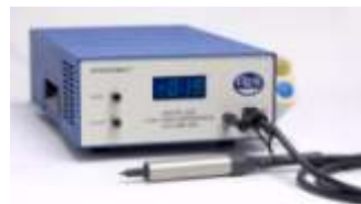
Figure 1 The Trek 820 InfiniTron® Voltmeter

The input resistance and input capacitance of a conventional Voltmeter rapidly drains the charge from the object under study. As an example, there can be a need to measure the surface voltage on a semiconductor chip package. Commonly, charge levels of a few nanoCoulombs can be stored on a capacitance of ~several picoFarads. Using a probe with a capacitance of 1 pF would drastically effect the measurement by transferring much of the charge from the test object upon contact. Furthermore, a probe input resistance of 10^9 \Omega drains the charge from the system in milliseconds, making the measurement useless.