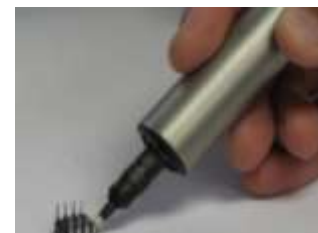
Figure 1: IC Pin Voltage Measurement

For example, if an ordinary voltmeter is used to measure the charge associated with a pin of an IC chip, when the instrument makes contact with the pin, all of the charge associated initially with this pin will be removed. As a result, the voltage indicated would be erroneous (the voltmeter will indicate 0 volts). However, the Model 820 can measure the pin voltage without discharging or affecting its voltage.