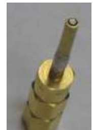
Figure 2: Probe Tip

Figure 2 shows a probe tip that can be used for scanning purposes. Figure 3 shows a test plate with strips alternately connected to a voltage source and ground. The probe was mounted at a distance of 500 \mu\text{m} from the plates. The voltage monitor output of the unit was connected to an oscilloscope. The waveform of the voltage measured by the voltmeter when the probe scanned the test plate from left to right is shown.