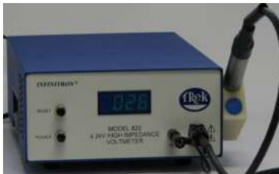
Figure 5: Probe holder shown at right

It is interesting to note that during normal operation, when using the hand-held probe, as the probe approaches the surface being measured, the Model 820 will indicate the voltage level of the measured surface even before actual contact is made. This occurs due to the virtual zero input capacitance of the probe in relation to the high capacitive coupling between the probe and test surfaces just before contact is made.